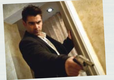
Colin Farrell in action